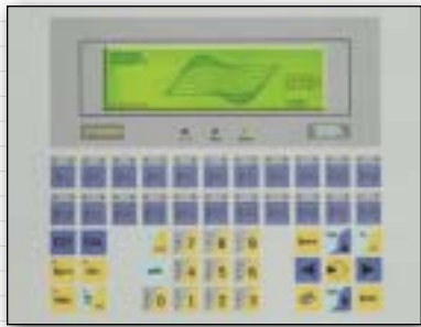
VT300W Monochrome STN LCD 240 x 64 - 39 keys