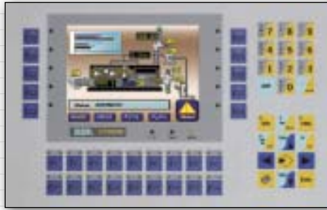
VT320W 16-Color STN LCD 320 x 240 (5.7") - 52 keys