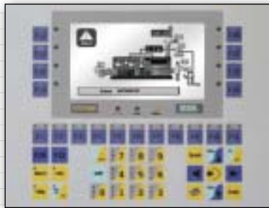
VT310W Monochrome STN LCD 240 x 128 (5.5") - 46 keys