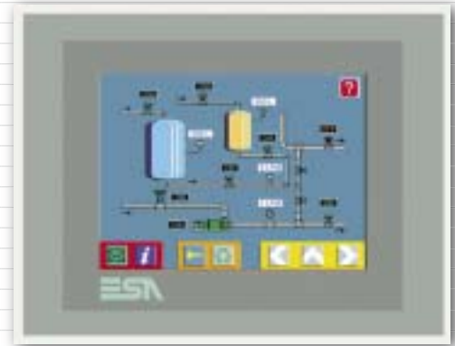
VT525W 16-Color STN LCD 320 x 240 (5.7")